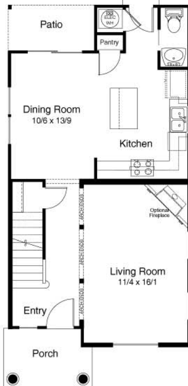
MAIN FLOOR PLAN 689 SQ. FT.

Renderings are artist's conceptions & are not intended to depict an actual building, finish, wall, ceiling, driveway or landscaping and are not to scale. Room sizes, square footage & ceiling details vary from one elevation to another. Square footages are approximate. In the interest of continuous improvement Legend Homes reserves the right to modify or change the floorplans, elevations & materials without prior notice or obligation. Such changes may not always be reflected in our models, displays or written materials. See Sales Representative for details. Prices & availability are subject to change without notice. Marketed by Legend Real Estate Services. CCB066563 05/2027