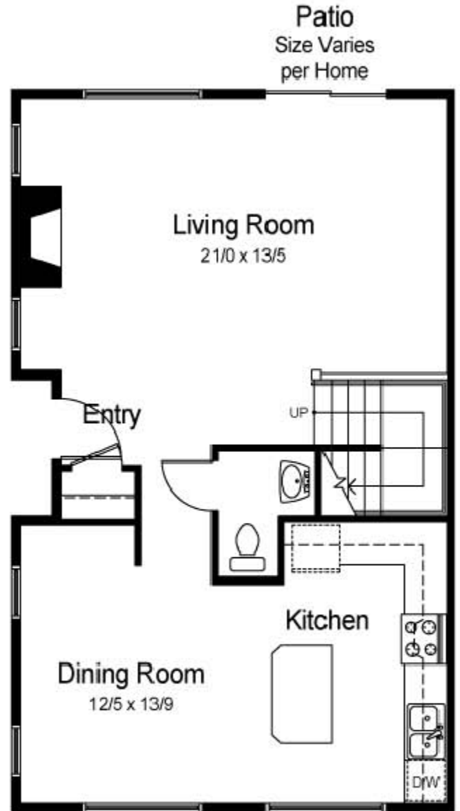
Main Level 778 Sq. Ft.

Marketed by Legend Real Estate Services. Renderings are artists' conceptions & are not intended to depict an actual building, fencing, walkway, driveway or landscaping & are not to scale. Square footages are approximate and based upon "architectural" measurements taken from architectural plans. Final square footages may differ, and the square footages as shown on the condominium declaration and plat will be based upon condominium measurement standards, which are not the same as "architectural" measurements. Room sizes, square footage & ceiling details vary from one elevation to another. In the interest of continuous improvement Legend Homes reserves the right to modify or change the floorplans, elevations & materials without prior notice or obligation. Such changes may not always be reflected in our models, displays or written materials. See Sales Representative for details. Prices & availability are subject to change without notice. CCB#60563 TH3 062606