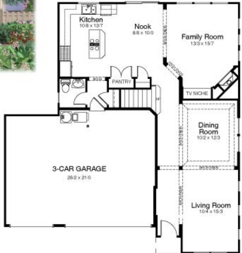
MAIN FLOOR PLAN 1098 SQ. FT.

Renderings are artist conceptions & are not intended to depict an actual building, framing, walling, driveway or landscaping and are not to scale. Room sizes, square footage and ceiling details vary from site to site. Square footages are approximate. In the interest of continuous improvement Legend Homes reserves the right to modify or change the floorplans, elevations and materials without prior notice or obligation. Such changes may not always be reflected in our models, digital or written materials. See Sales Representative for details. Prices & availability are subject to change without notice.