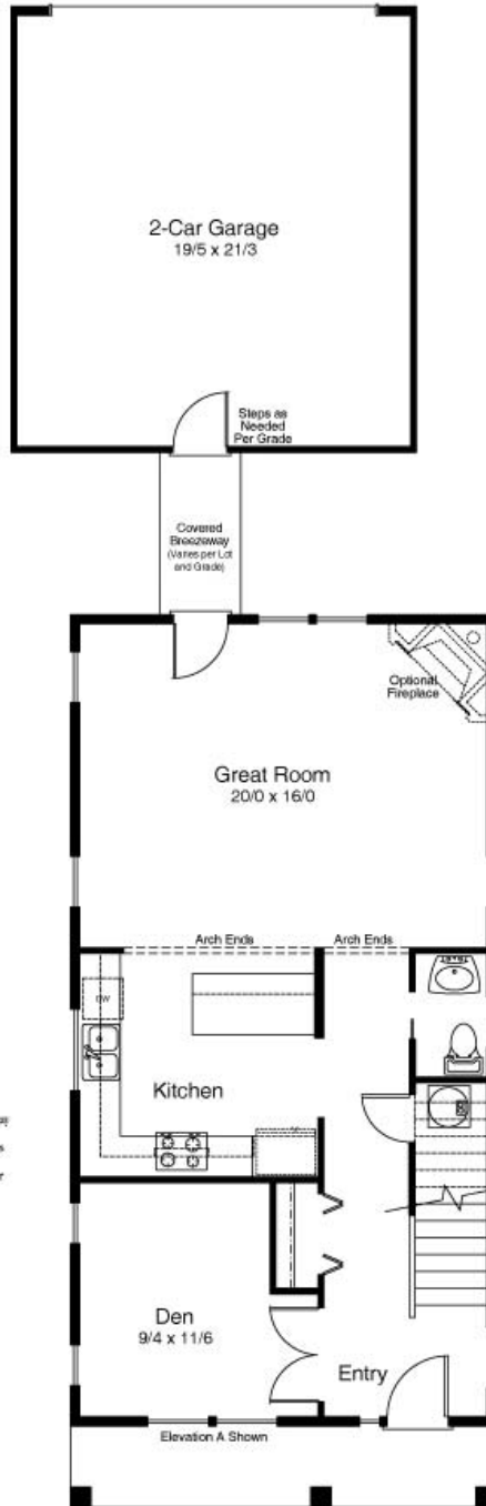
MAIN FLOOR PLAN 840 SQ. FT.

Renderings are artist's conceptions & are not intended to depict an actual building, listing, selling, driveway or landscaping and are not to scale. Room sizes, square footage & ceiling details vary from one elevation to another. Square footages are approximate. In the interest of continuous improvement Legend Homes reserves the right to modify or change the floorplans, elevations & materials without prior notice or obligation. Such changes may not always be reflected in our models, displays or written materials. See Sales Representative for details. Prices & availability are subject to change without notice. Marketed By Legend Real Estate Services. CCB469563 09/2027