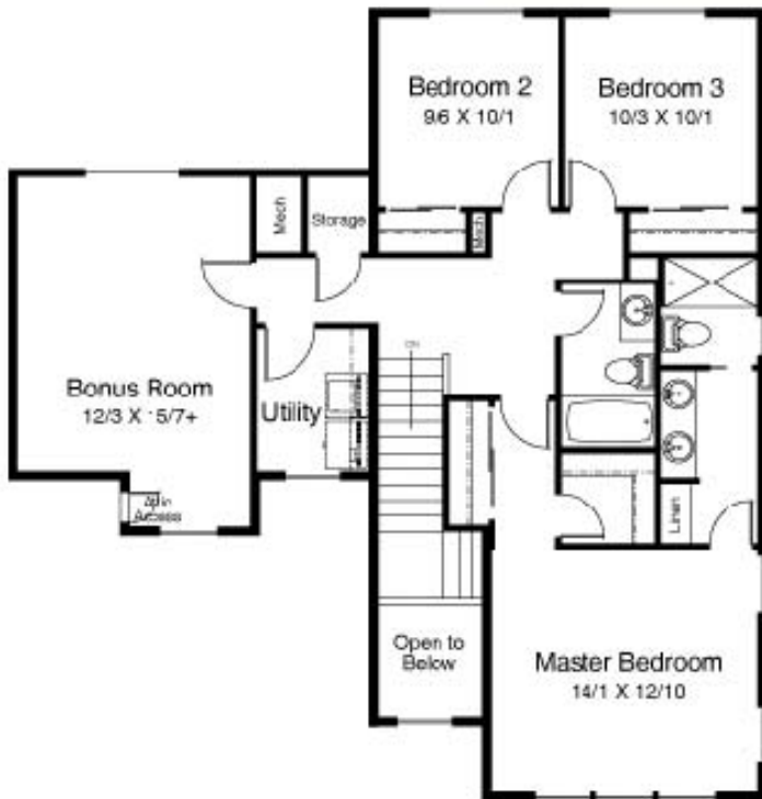
SECOND FLOOR 1098 SQ. FT.