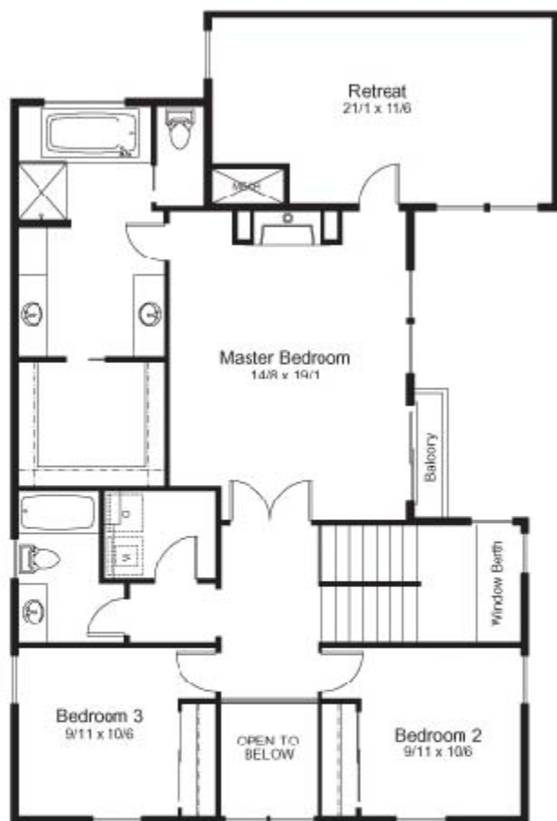
■ SECOND FLOOR PLAN 1333 SQ. FT.