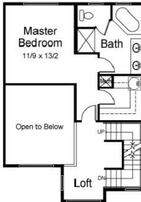
Upper Level 575 Sq. Ft.