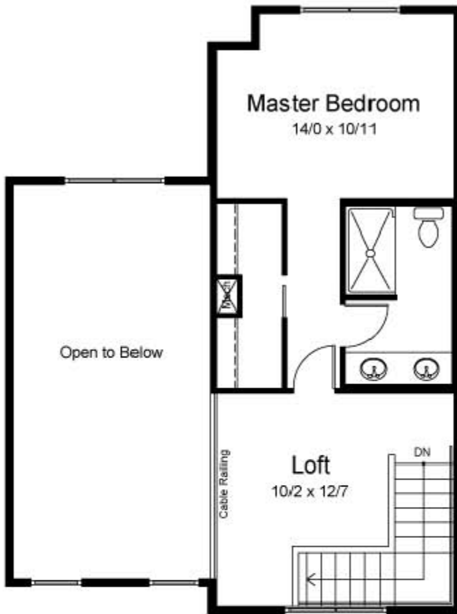
Upper Level 747 Sq. Ft.