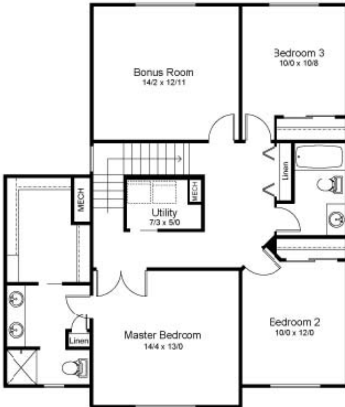
SECOND FLOOR PLAN 1134 SQ. FT.