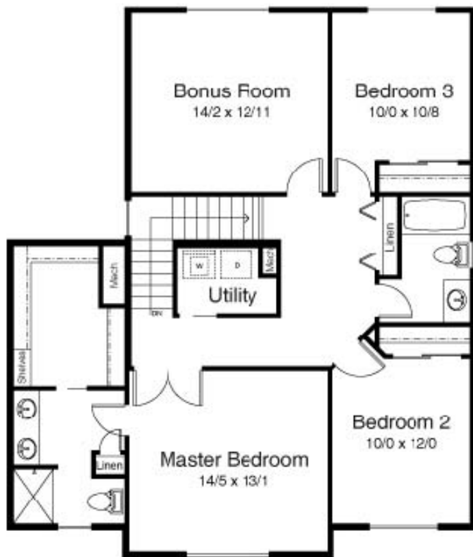
SECOND FLOOR PLAN 1134 SQ. FT.