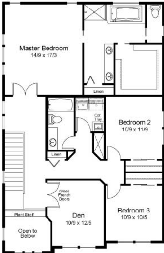
■ SECOND FLOOR 1321 SQ. FT.