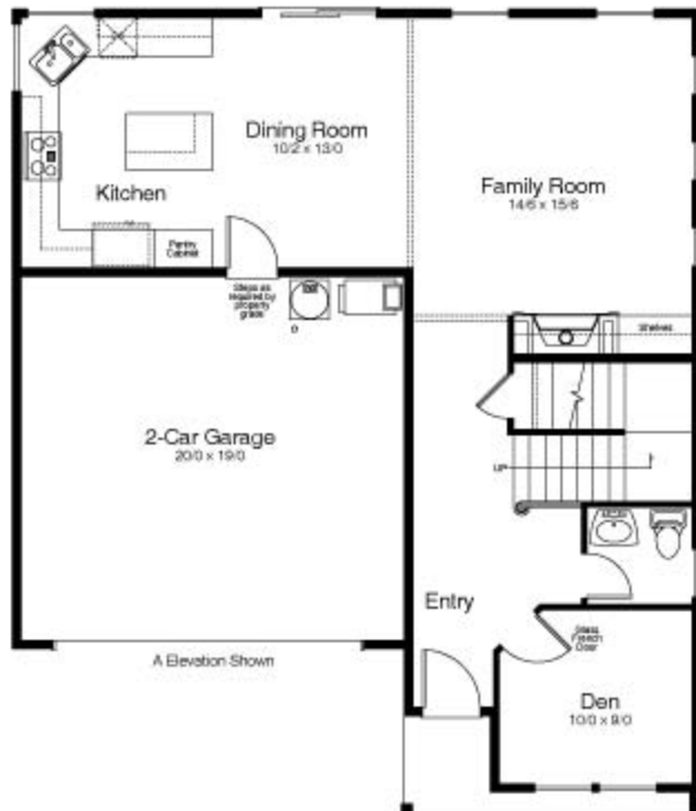
MAIN FLOOR PLAN 905 SQ. FT.

Renderings are artistic conceptions & are not intended to depict an actual building, listing, walkway, driveway or landscaping and are not to scale. Room sizes, square footage and ceiling details vary from one elevation to another. Square footages are approximate. In the interest of continuous improvement Legend Homes reserves the right to modify or change the floorplan, elevations, specifications and materials without prior notice or obligation. Such changes may not always be reflected in our models, displays or written materials. See Sales Representative for details. Prices & availability are subject to change without notice.